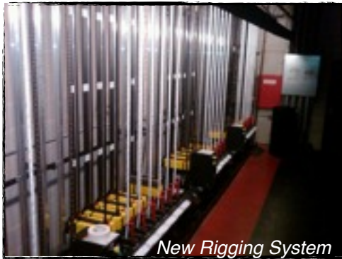
New Rigging System

For returning students the school year often begins with the same rituals. We walk through the same doors, we greet familiar students and faculty and staff, we meet the “newbies” and spread the welcome. This year, however, was slightly different because our physical surroundings had a bright new look.