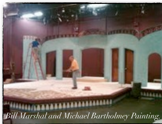
Bill Marshal and Michael Bartholmey Painting.

The show runs September 30 - October 3 and October 7 - October 10.