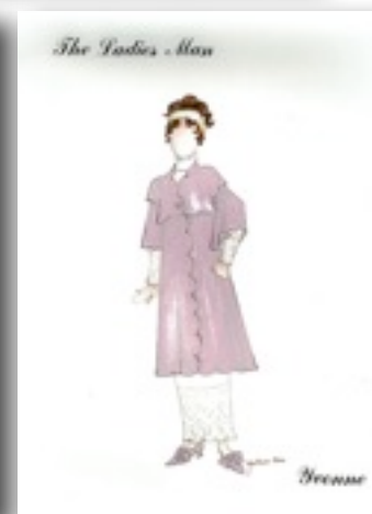
Costume Renderings by Yslan Hicks