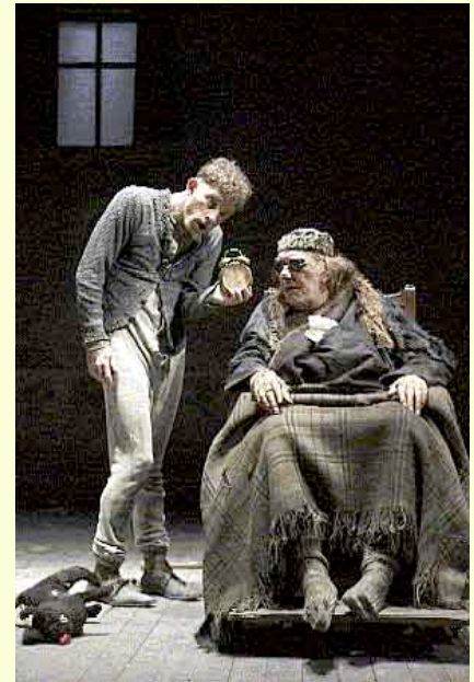
Michael Gambon as Hamm and Lee Evans as Clov in Endgame at the Albery Theatre in London.

"Do you believe in the life to come?" asks Clov. "Mine was always that," is Hamm's dourly droll reply, confirming his mother Nell's contention that "nothing is funnier than unhappiness".