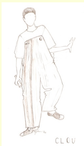
Clov; designed by Yslan Hicks