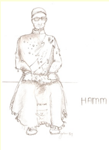
Hamm; designed by Yslan Hicks