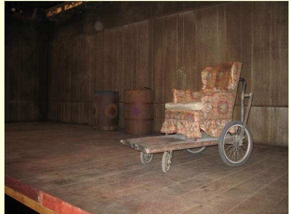
"Bill's model brought to life!"